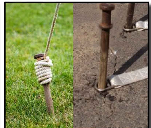
Stakes: Grass, gravel & asphalt surfaces