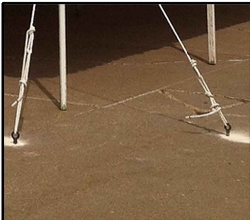
Concrete Anchors: Concrete surface only