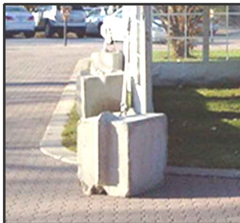
1000 lbs Concrete Blocks: Any hard surface