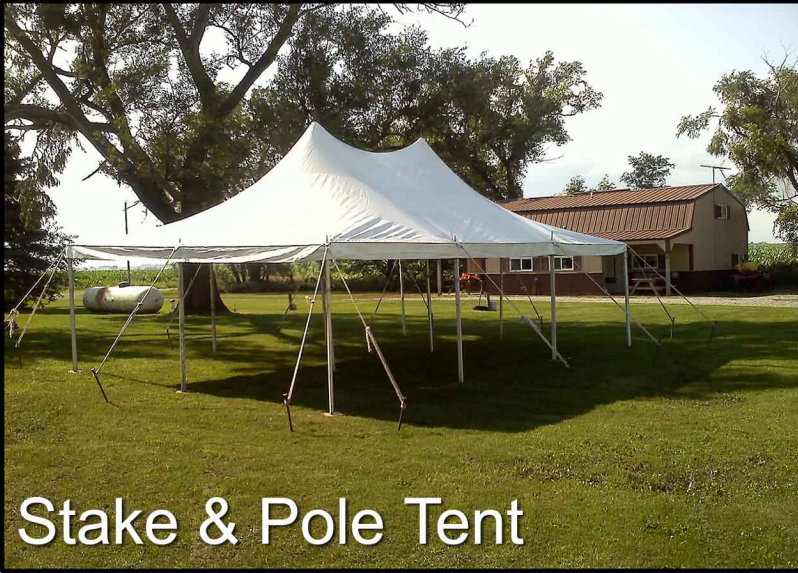
Stake & Pole Tent

Stake and pole tents require an anchoring point at every side pole and 2 at every corner pole.